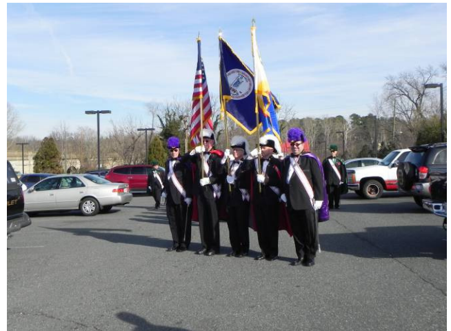
FOURTH DEGREE COLOR GUARD