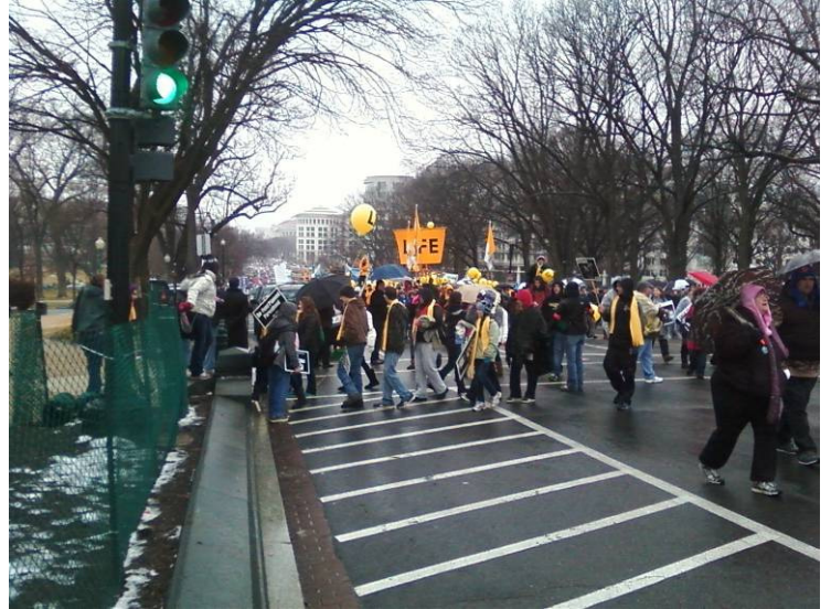
MARCH FOR LIFE ON CONSTITUTION AVENUE