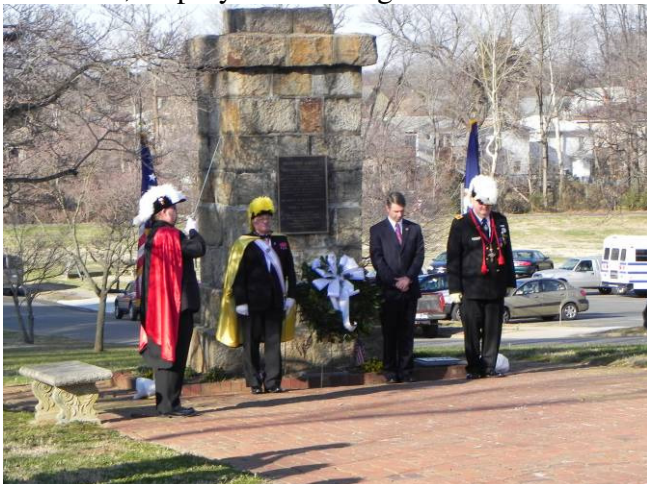
KNIGHTS AND CONGRESSMAN AT THE RELIGIOUS FREEDOM MEMORIAL