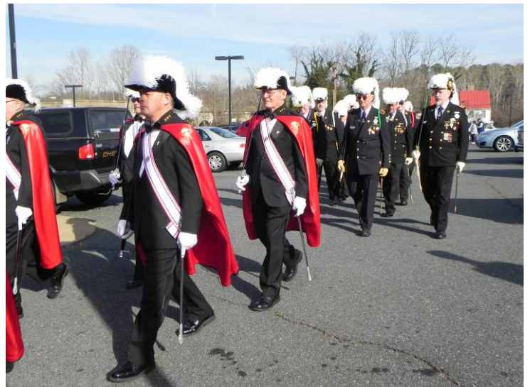
BEGINNING THE RELIGIOUS FREEDOM MARCH