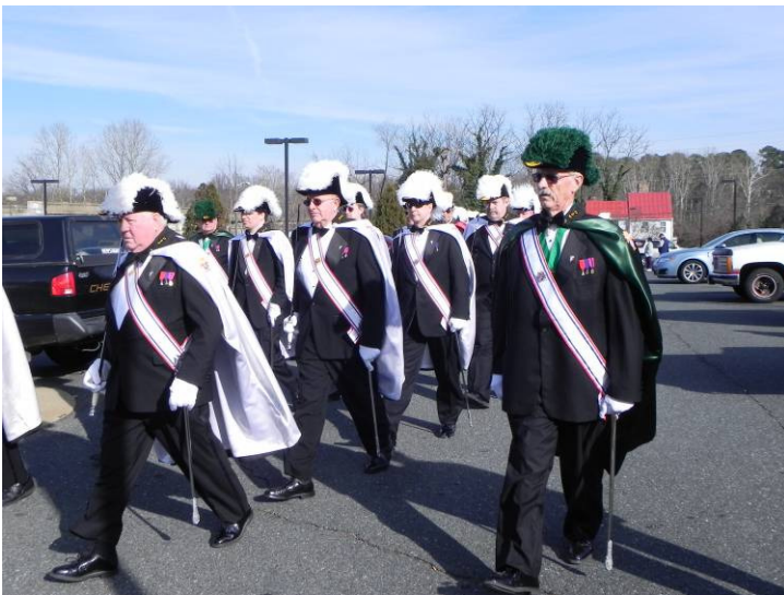
BEGINNING THE RELIGIOUS FREEDOM MARCH