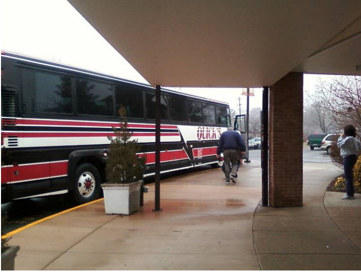
BUS PROVIDED BY COUNCIL 4034 ABOUT TO LEAVE SAINT MARY