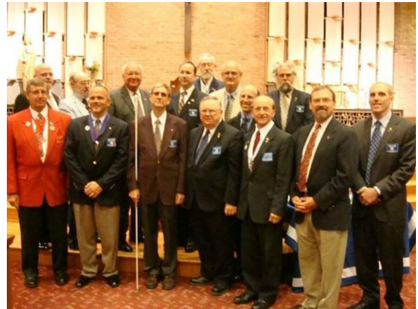
INSTALLATION CEREMONY FOR OFFICERS OF 2009-2010 FRATERNAL YEAR