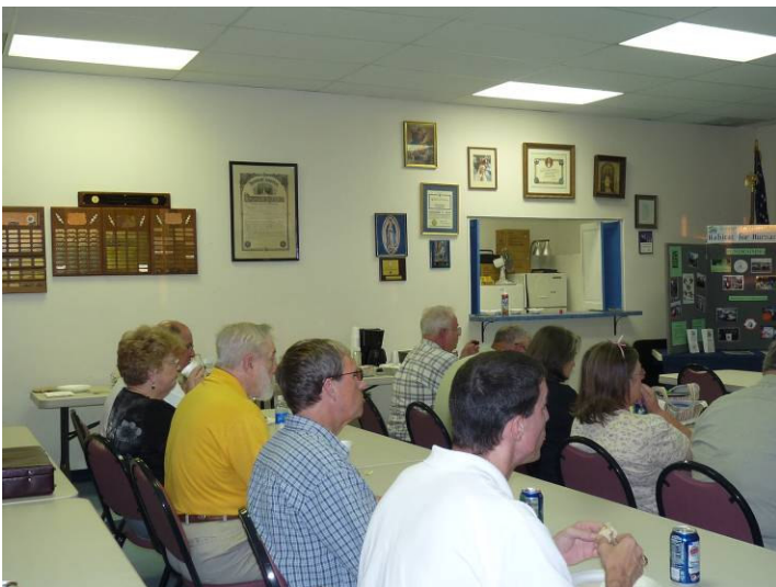
KNIGHTS AND FAMILIES LISTENING TO THE HABITAT FOR HUMANITY PRESENTATION